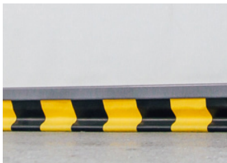
Black and yellow safety bottom clearly marks Machine Guard safety zone.