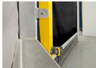
The dual RF sensor interlock system prevents machine operation until door is fully closed.