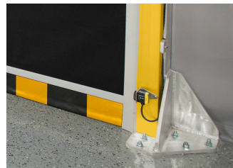
Yellow powder coated side guides clearly marks Machine Guard safety zone.