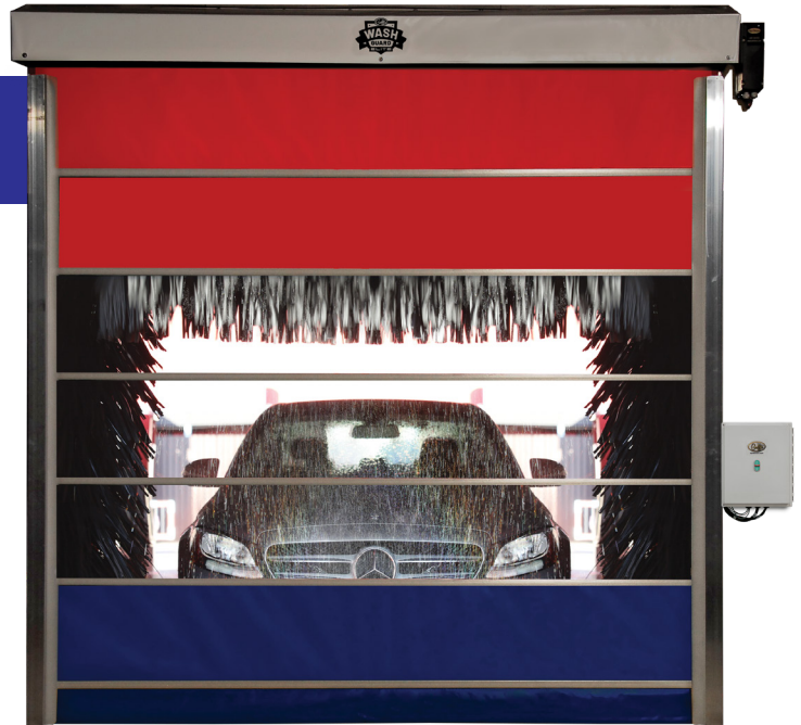
11' x 11' door pictured with red & blue vinyl & (3) vision panels

STANDARD FEATURES: Full-Width Roll Cover Auto-Reset After Impact 3 Full-Width Windows Auto-Close Door Timer Replaceable Door Panels Fiberglass Wind Bars