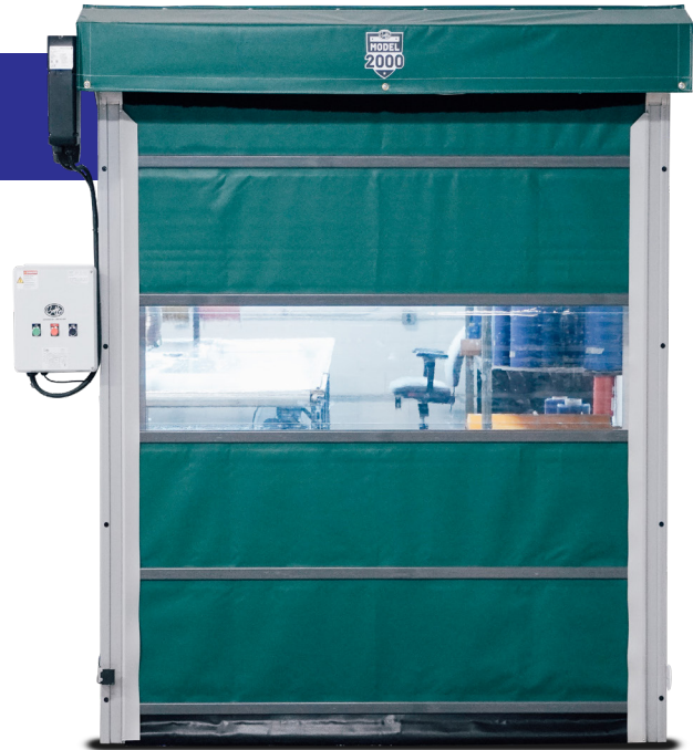
6' x 7' door pictured with green & vision panels