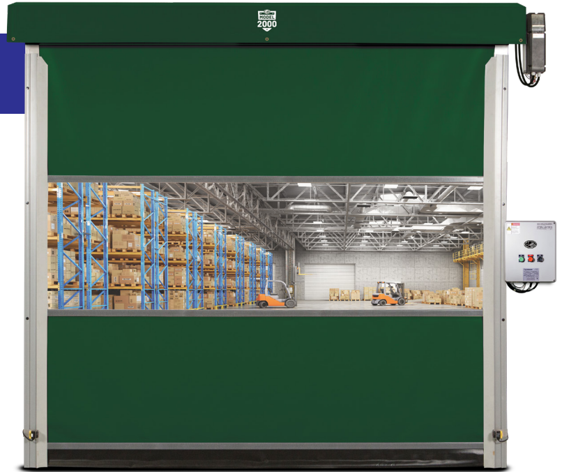
10' x 10' door pictured with green & vision panels