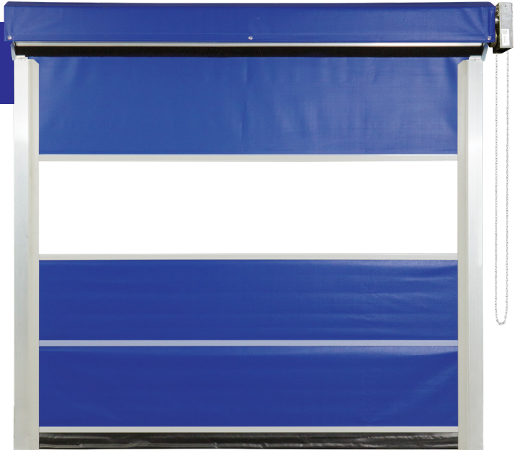
8' x 8' door pictured with blue & vision panels