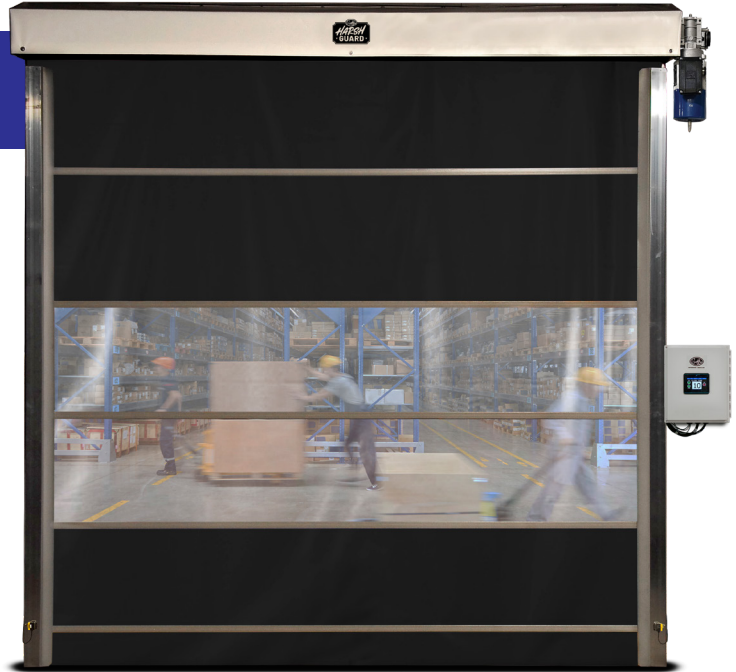
10' x 10' door pictured with black & vision panels