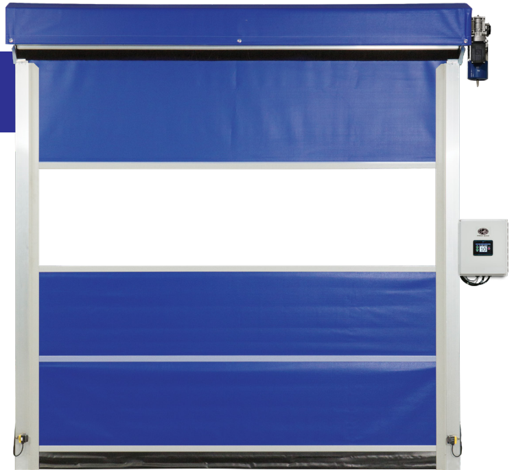
10' x 10' door pictured with blue & vision panel